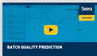
Video: Predicting batch quality with advanced analytics