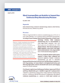
Case Study: Merck Leverages Data and Analytics to Support New Continuous Drug Manufacturing Processes

Tridiagonal Solutions www.tridiagonal.com info@tridiagonal.com