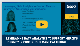
Video: Leveraging Data Analytics to Support Merck's Journey in Continuous Manufacturing