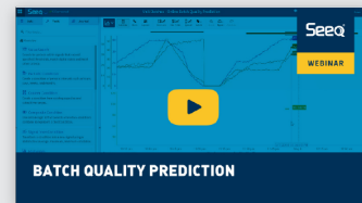
Video: Predicting batch quality with advanced analytics