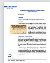
Case Study: Improving Manufacturing Productivity at Abbott Nutrition

Tridiagonal Solutions www.tridiagonal.com info@tridiagonal.com