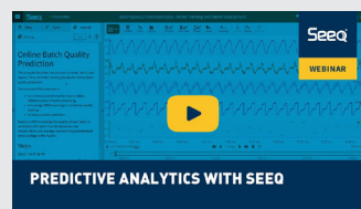
Video: Predictive Analytics with Seeq

Tridiagonal Solutions www.tridiagonal.com info@tridiagonal.com