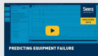
Video: Predicting Equipment Failure